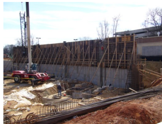
Work Continues at CMC Mercy